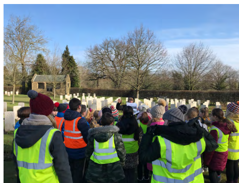
LOCAL SCHOOL CHILDREN DURING A GUIDED VISIT TO HARROGATE (STONEFALL) CEMETERY, YORKSHIRE

Right now, we need volunteers to support our work, telling the stories of those of the fallen and introducing visitors to our sites and rich heritage. Volunteers are at the heart of our vision to engage the public with who we are and what we do.