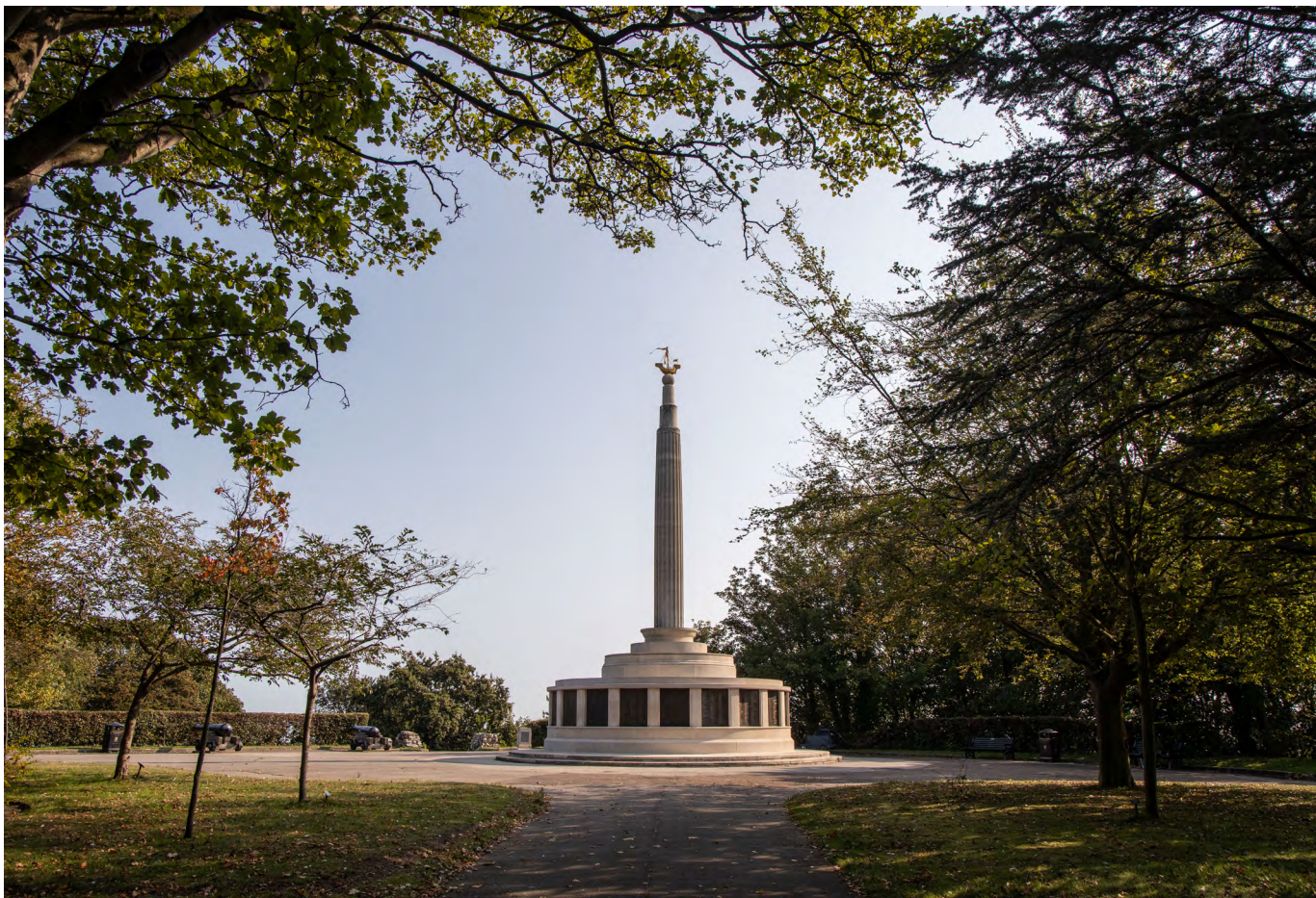
LOWESTOFT NAVAL MEMORIAL, NORFOLK

Today, over a century after we first began, our work continues through our staff, supporters and volunteers who preserve our unique cultural, horticultural and architectural heritage and ensure that the stories of those who died are told.