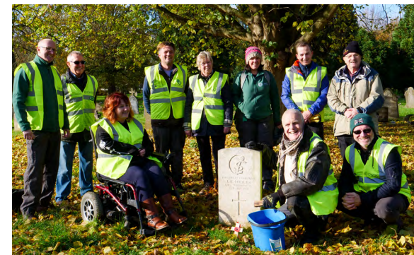
EYES ON, HANDS ON TRAINING DAY, KING'S LYNN, 2019.