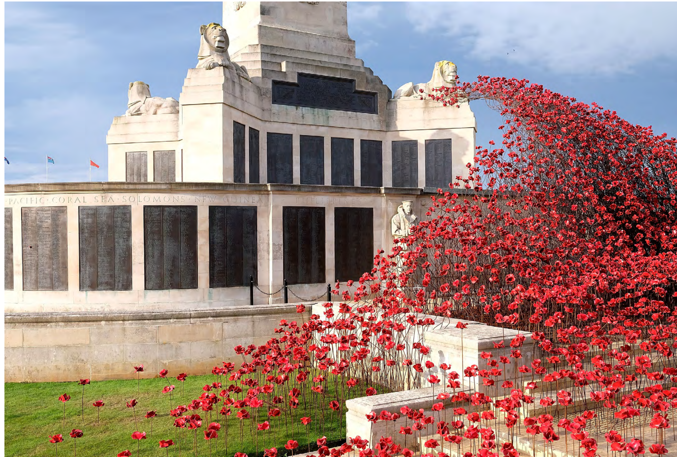
14-18 NOW POPPIES WAVE AT THE CWGC PLYMOUTH NAVAL MEMORIAL, 2017

Today, we are building on that legacy and recognise that volunteers are key, working with our staff, helping us engage a broader section of the public and raising the profile of what our extraordinary organisation stands for.