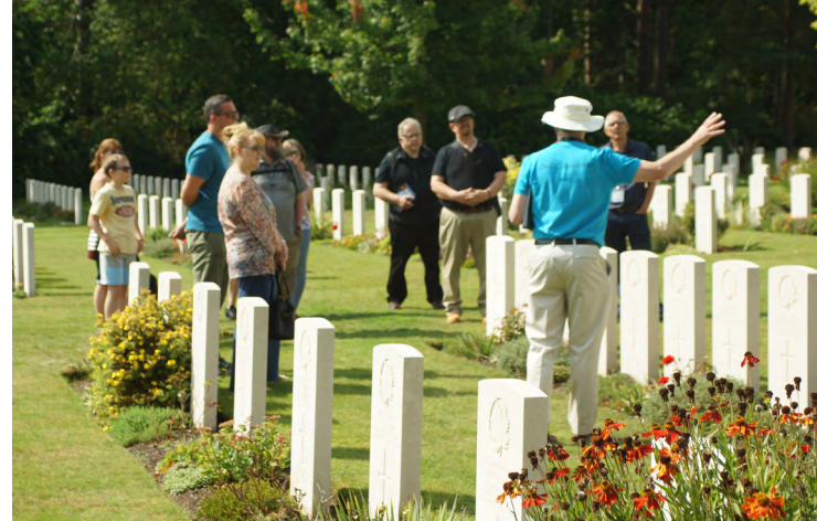
CWGC VOLUNTEERS LEAD TOURS OF BROOKWOOD MILITARY CEMETERY, 2017.

For those living further afield from our Head Office in Maidenhead, volunteers have been encouraged to undertake tasks using our online resources, which includes writing more detailed descriptions for some of our digitised collection, or transcribing scans of hand-written documents.