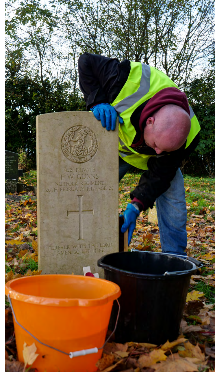
USING A SOFT BRUSH AND WATER, EYES ON, HANDS ON VOLUNTEERS HELP TO MAINTAIN HEADSTONES BY KEEPING THEM CLEAN.